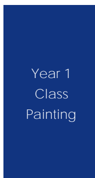
Year 1 Class Painting