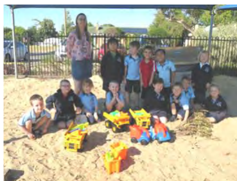
New Foundation Students