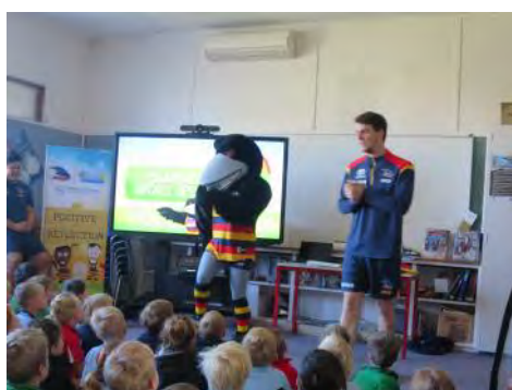
Adelaide Crows Clinic