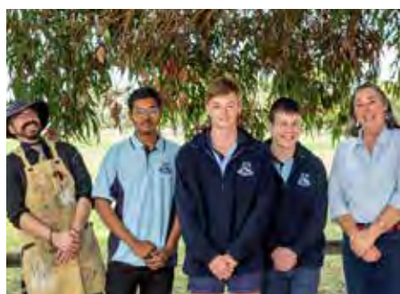
10-12 Focus Class