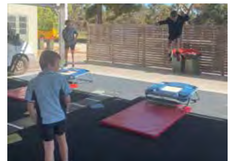
Smiling Minds Workshop

Suggestion & Feedback - DL.0438.feedback@schools.sa.edu.au or to the box in the front office.